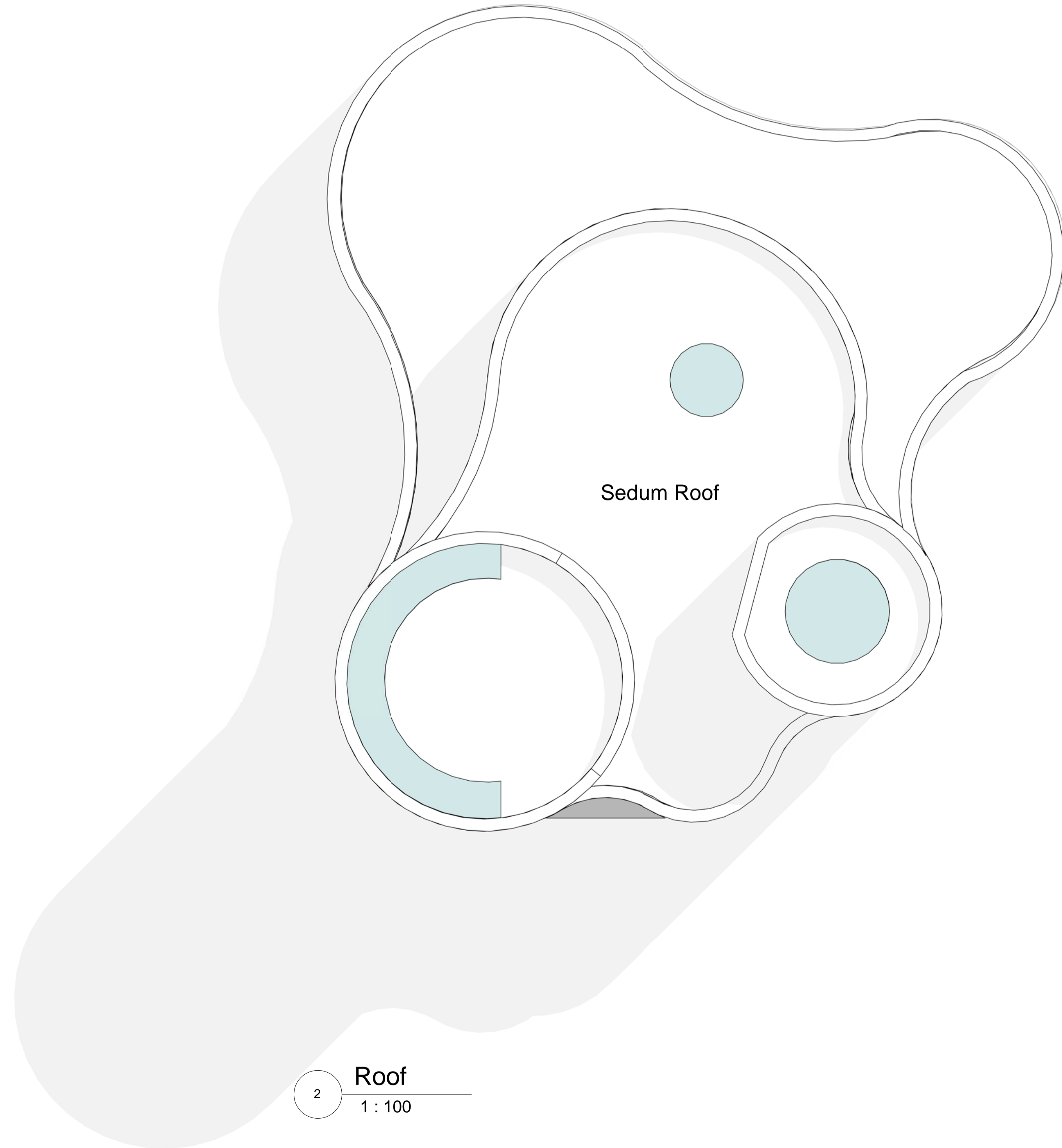
2 Roof 1 : 100